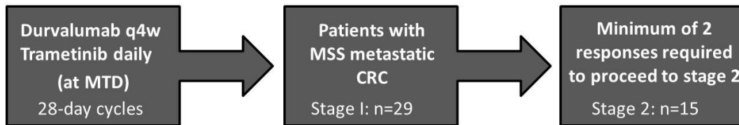
Figure 2: Study design

Preliminary analysis based on the first 29 patients enrolled