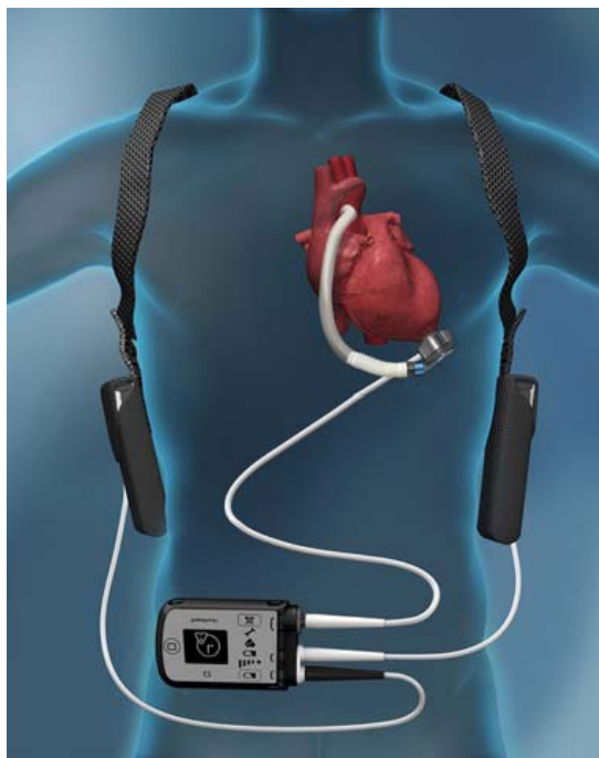
Figure 1 – HeartMate 3 System during Battery-powered Operation

The HM3 LVAD contains an Inflow Cannula, a Pump Cover, a Lower Housing, a Screw Ring to attach the Pump Cover to the Lower Housing, a Motor, the Outflow Graft, and a Pump Cable.