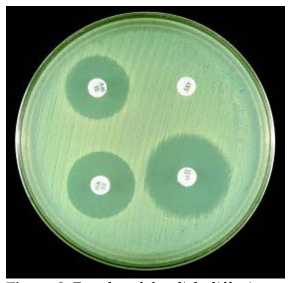
Figure 2. Results of the disk diffusion assay. This Shigella isolate is resistant to trimethoprim-sulfamethoxazole and is growing up to the disk (SXT), the zone of which is recorded as 6 mm.

undersurface of the plate without opening the lid. The zones of growth inhibition will be compared with the zone-size interpretative table and recorded as susceptible, intermediate, or resistant to each drug tested according to CLSI guidelines (see Appendix).