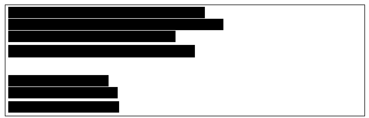
Table 7: SAE Reporting Contact Information

To report the SAE, fax the completed SAE form to (fax numbers listed in Table 7) within 24 hours of awareness.